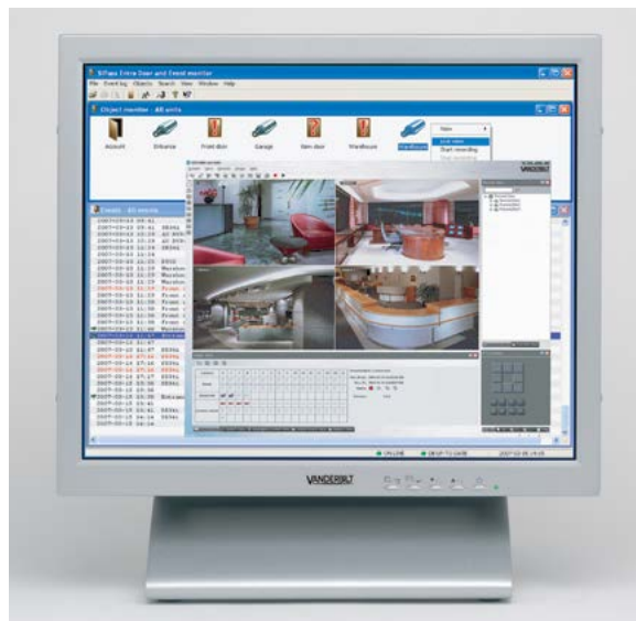
Video recordings are accessible directly from the Entro software