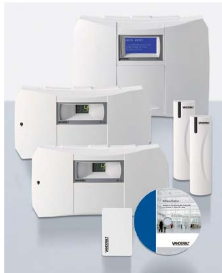
Entro starter kit