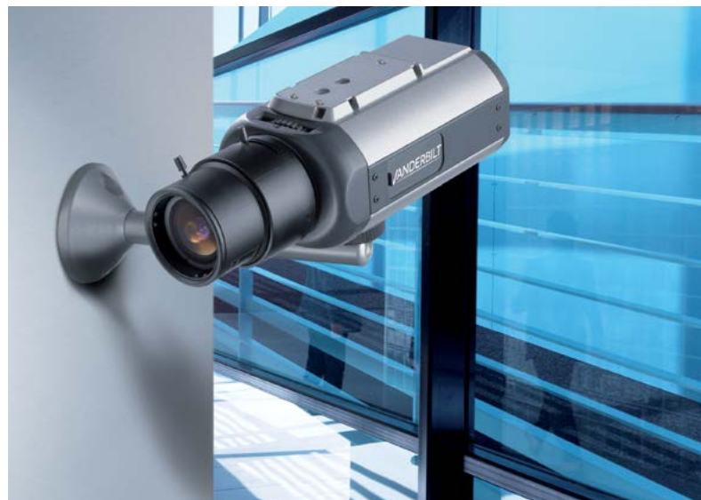
Video surveillance camera from Vanderbilt